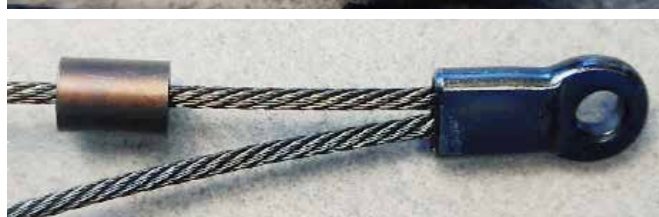
Picture 1: Examples of different color effects on the different materials rope, sleeve and eyelet