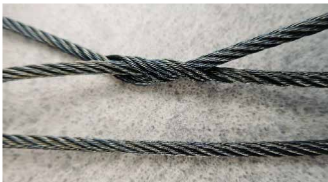
Picture 2: Surface details are retained, because the workpieces are not coated during the spectral process